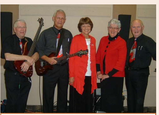
Reflections (Edmonton, AB)

good relationship with the Lord, as well as a family that supports her and all the people that have been following her since she started her first gospel show.