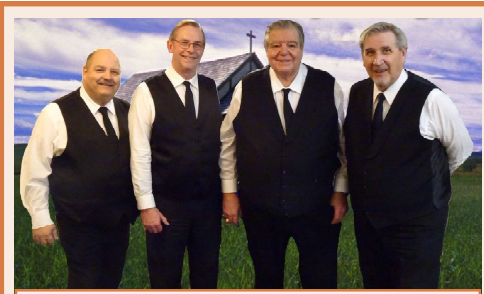
Visions Country Gospel (Red Deer, AB)

A Country Gospel Group with an attitude of gratitude and fun, began in April of 2001. Good old songs presented in a refreshing way, some original tune's and a mix