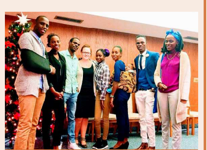
Rehoboth Worship Team (Edmonton, AB)