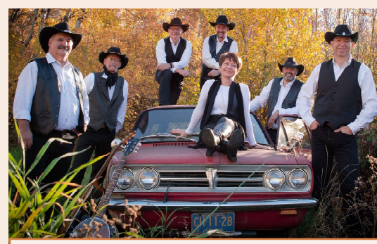
Crimson River (Peace River, AB)

Three and Company is a contemporary southern gospel trio from Alberta, Canada with smooth harmonies and songs to uplift and encourage the church body. They have been singing together as a trio since 2000. The group is a Member of Canada's Gospel Music Assocation.