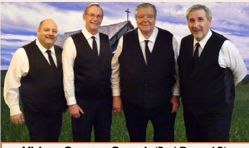
Visions Country Gospel (Red Deer, AB)

Wherever God leads us we will go. We love to share God's message of love through song.